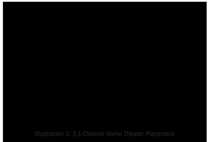
Illustration 1: 5.1-Channel Home Theater Placement